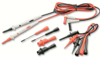
U1160A Standard test lead kit