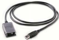
U5481A IR-to-USB cable