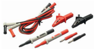
U1161A Extended test lead kit