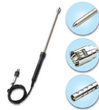
U1181A Immersion temperature probe U1182A Industrial surface temperature probe U1183A Air temperature probe