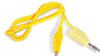
U5402A Yellow test lead for mA simulation

More accessories at: www.agilent.com/find/handheld-calibrator-meter