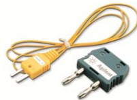
U1186A K-type thermocouple and adapter